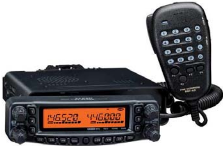
Yaesu FT-8900R Quad Band Mobile with Separation Kit