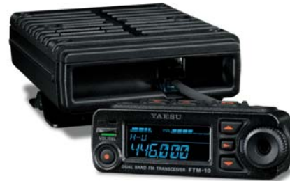
Yaesu FTM-10R 2m / 70cm Mobile

Entry fee does not include raffle tickets. You need not be present to win Raffle Prizes. There will be a separate raffle table in the main building, or you may purchase raffle tickets at the door without attending the Hamfair. All prizes are guaranteed. Raffle tickets will be sold ONLY at the Hamfair.